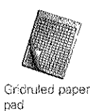
Gridruled paper pad