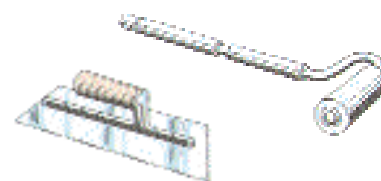
ROLLER AND TROWEL