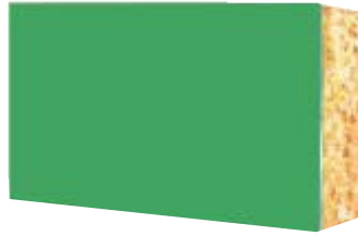
VITRACITE CHALKBOARD PANEL