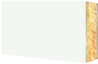
LCS MARKERBOARD PANEL