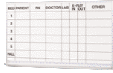
MARKERBOARD WITH CUSTOMER-SPECIFIED PERMANENT LETTERS AND RULING