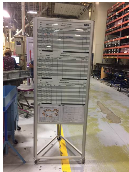
QP10741 Mobile Magnetic