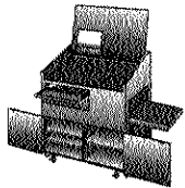
42" Multi Media Lectern