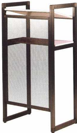
EURO MEETING LECTERN