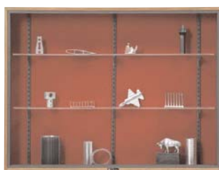
309 SLIDING DOOR DISPLAY CASE