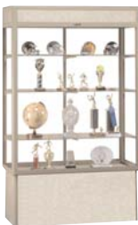
1453 NOUVEAU SERIES DISPLAY CASE