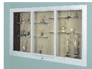
390 LARGE DOOR RECESSED DISPLAY CASE