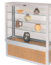
332 WOOD BASE FREESTANDING DISPLAY CASE