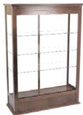
651 CLASSIC SERIES SLIDING DOOR DISPLAY CASE