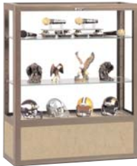
1450 NOUVEAU SERIES DISPLAY CASE