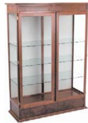
650 CLASSIC SERIES HINGED DOOR DISPLAY CASE