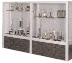
PREMIERE FREESTANDING CASE WITH WOOD BASE

Note: Specify shelf width, frame finish and type and color of back panel.