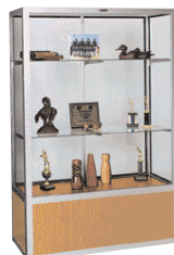
334 & 335 FREESTANDING DISPLAY CASE