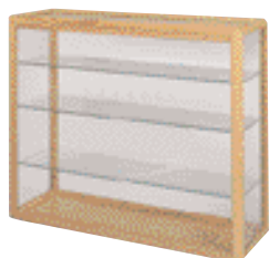
741 TABLE OR COUNTER TOP DISPLAY CASE