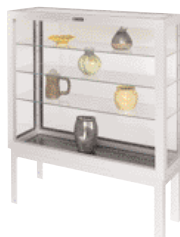
331 FREESTANDING DISPLAY CASE