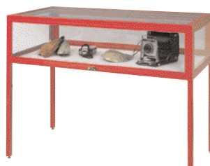
329 & 327 TABLE EXHIBIT CASE