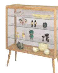
739 FREESTANDING DISPLAY CASE