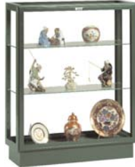
1451 NOUVEAU SERIES DISPLAY CASE