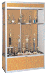
737 UNIVERSAL SERIES DISPLAY CASE