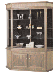
649 EXECUTIVE SERIES DISPLAY CASE

Note: Specify shelf width, frame finish and type and color of back panel.