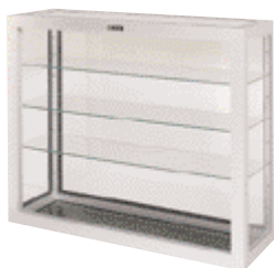
WALL MOUNTED OR TABLE TOP DISPLAY CASE