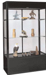
748 UNIVERSAL SERIES DISPLAY CASE