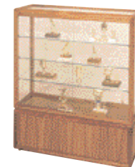
742 FREESTANDING DISPLAY CASE