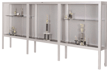
PREMIERE FREESTANDING CASE WITH ALUMINUM LEGS