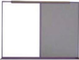
SHOWN WITH OPTIONAL POWDER COAT FINISH