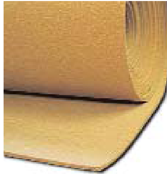
TAN NUCORK: COLOR OPTIONS