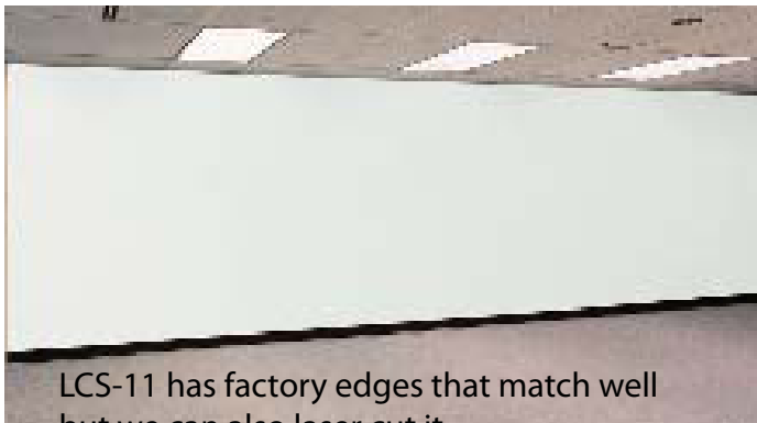
LCS-11 has factory edges that match well but we can also laser cut it