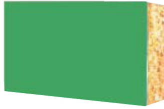
VITRACITE CHALKBOARD PANEL