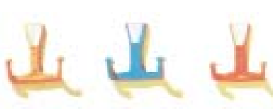
DOUBLE PRONG NYLON HOOKS

Steel rail available in Powder Coat colors. See page 80.