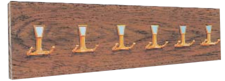
WAW129 HOOK PANEL – DARK FINISH OAK