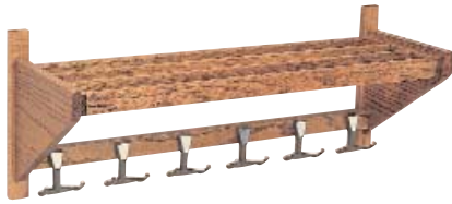
WAW127 HAT AND COAT RACK – DARK FINISH OAK