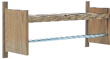
WAW126 HAT AND COAT RACK – DARK FINISH OAK