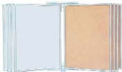
CHART STAND & SWING LEAF DISPLAY: