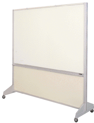
PREMIERE ROOM DIVIDER