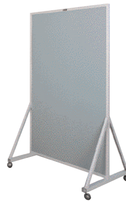
629 MULTI-USE DIVIDERS