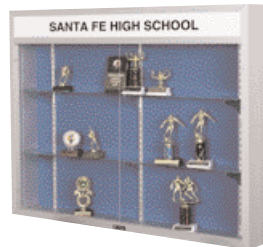
IMPERIAL SERIES DISPLAY CASE WITH HEADER PANEL