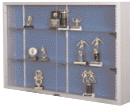
IMPERIAL SERIES DISPLAY CASE