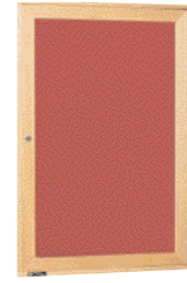
3052 DIRECTORY CABINET