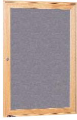
3070 WOOD FRAME BULLETIN BOARD CABINET