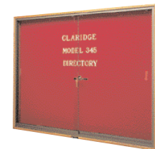
345 DIRECTORY CABINET