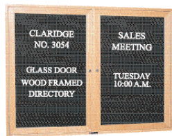
3054 DIRECTORY CABINET