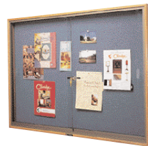
310 BULLETIN BOARD CABINET