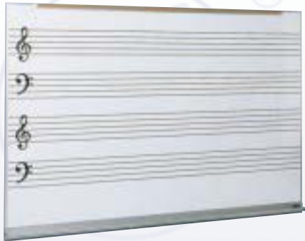
Motor freight class 70.