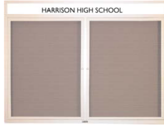
CONTEMPORARY BULLETIN BOARD CABINETS WITH HEADER PANEL