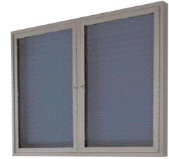
541 & 544 DIRECTORY CABINET