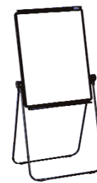
145 SERIES REVERSIBLE EASEL