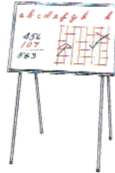
186 SERIES EASEL