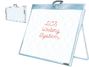
57 SERIES PORTABLE LECTURE BOARD