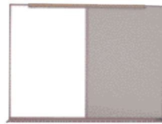
800 SERIES TYPE BR/BL COMBO – 5/8" FACETRIM (SHOWN WITH OPTIONAL POWDER COAT FINISH)