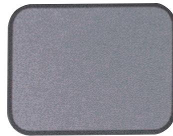
1200 SERIES TACKBOARDS – 5/8" FACE TRIM RADIUS CORNERS (SHOWN WITH OPTIONAL POWDER COAT FINISH)