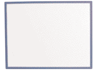
DECORATOR MLC SERIES – 5/8" FACE TRIM WITH POWDER COAT FINISH