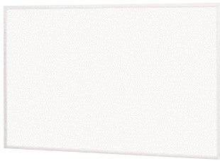
MLC ECONOMY – 3/8" FACETRIM