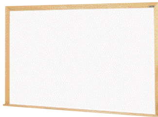
MLC DELUXE SERIES – 1-3/4" FACETRIM