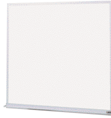
MLC DELUXE – 1-1/4" FACETRIM – NO MAP RAIL