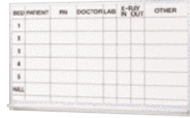
MARKERBOARD WITH CUSTOMER-SPECIFIED PERMANENT LETTERS AND RULING