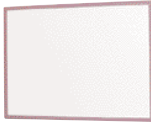
DECORATOR LCS SERIES – 5/8" FACE TRIM WITH POWDER COAT FINISH