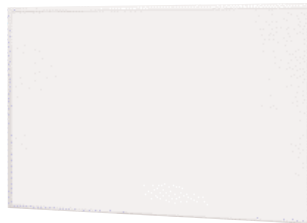
LCS ECONOMY SERIES – 5/8" FACETRIM