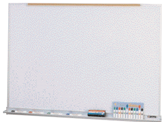
LCS DELUXE – 5/8" FACE TRIM – WITH MAP RAIL