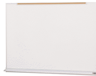
800 SERIES – 5/8" FACE TRIM