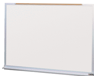
1300 SERIES – 1-1/4" FACE TRIM

Note: Finished size of units is 1/4" larger in both height and width than sizes listed. If exact overall size is required, specify when ordering.