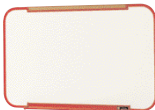
1200 SERIES – 5/8" FACE TRIM (SHOWN WITH OPTIONAL POWDER COAT FINISH)