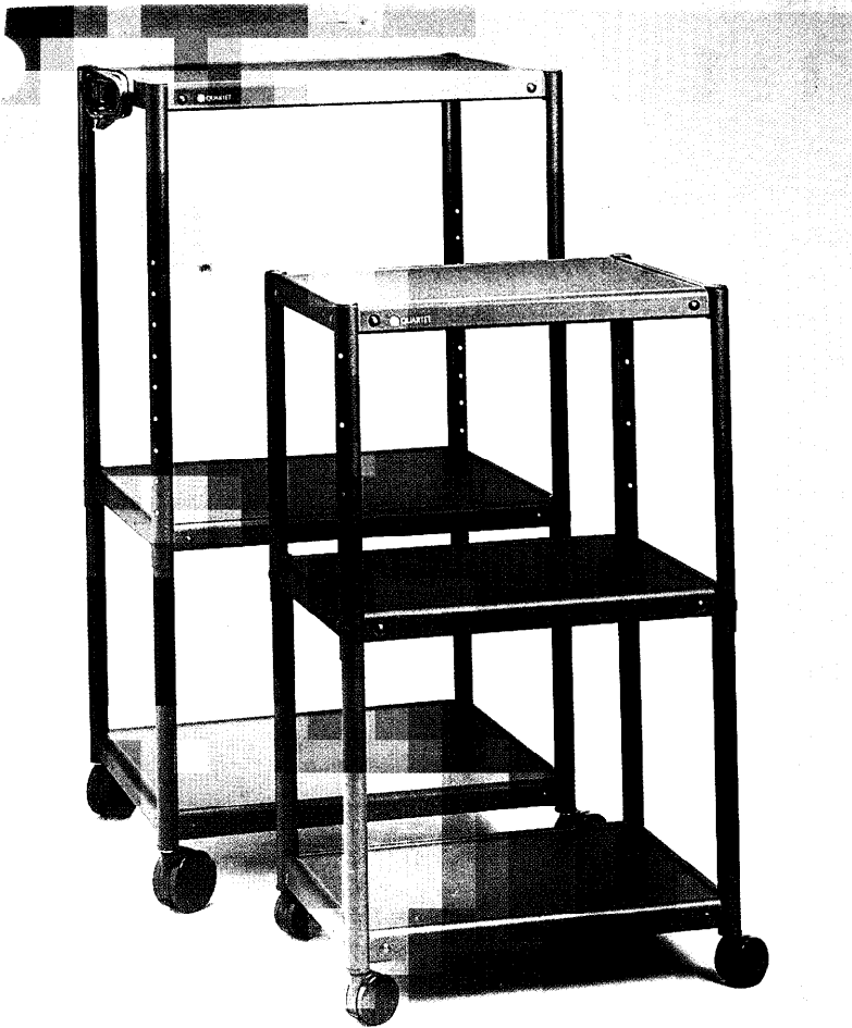
The top shelf of these carts adjusts to raise or lower AV equipment to desired level