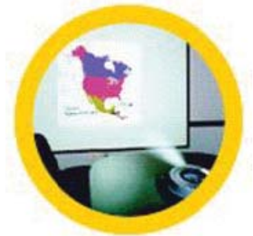
Project and Dry Erase