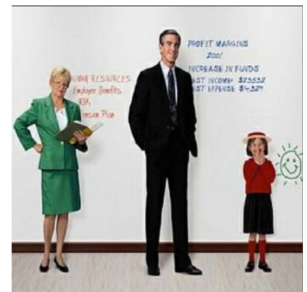
Floor To Ceiling