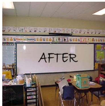
Economically Resurface Old Chalkboards