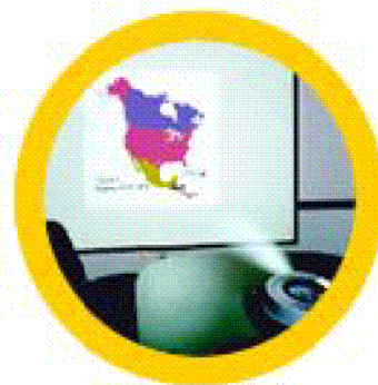
Project and Dry Erase