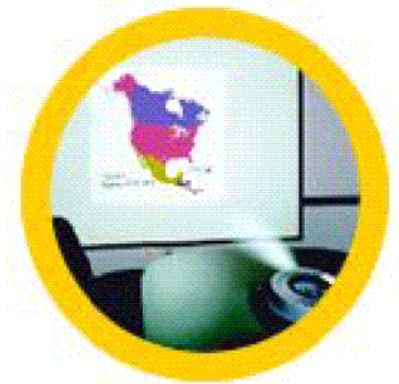
Project and Dry Erase