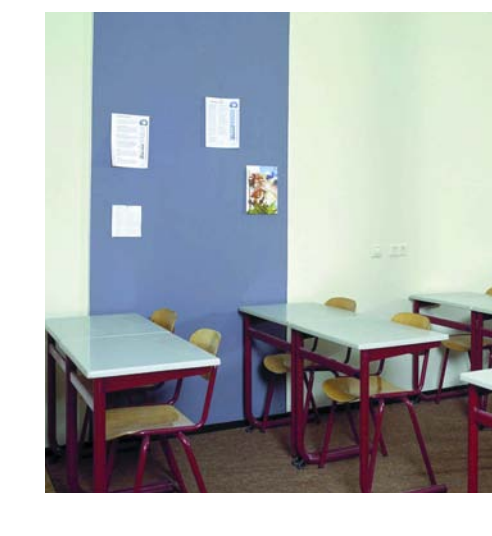
Bulletin Board is made from all natural ingredients: linseed oil, granulated cork, and pine rosin binders on a natural jute backing. It emits no harmful emissions, (V.O.C's) or carcinogens. It has properties that inhibit bacterial growth. And, even after a long life, the cork is bio-degradable.