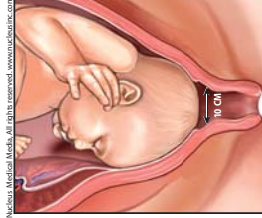
D. Cervix is fully dilated to 10 cm.