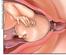
C. Cervix is dilated to 5 cm.