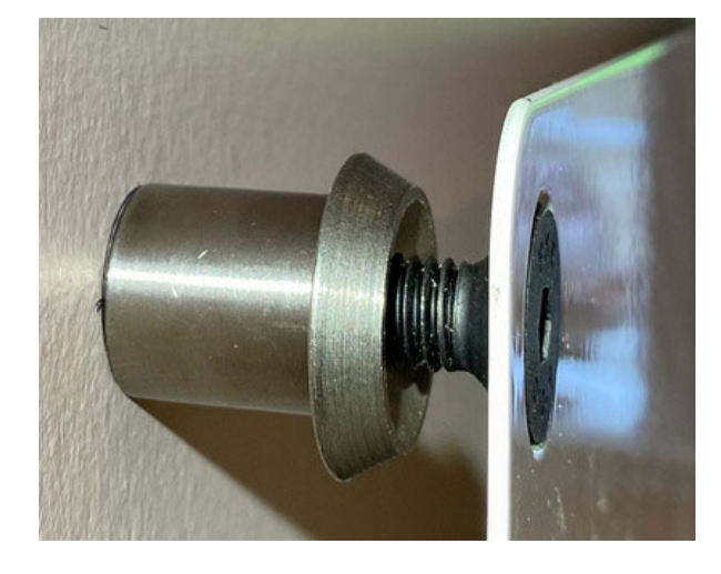
<==. Mounted steel ready for overlays. Insert and lens cover or filmed overlay